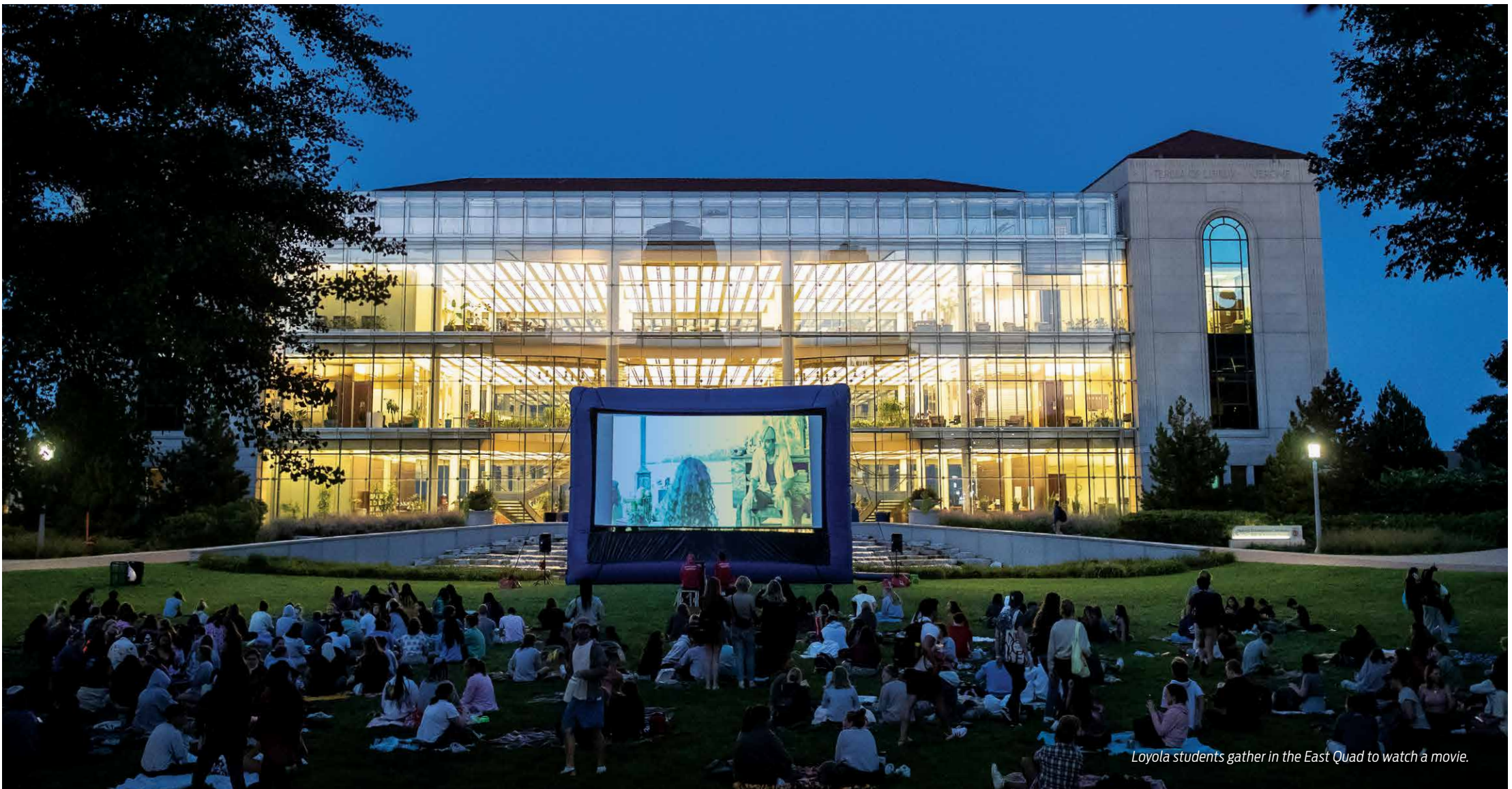
Loyola students gather in the East Quad to watch a movie.